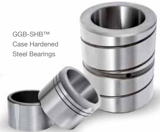
GGB-SHB™ Case Hardened Steel Bearings

Learn more about GGB-SHB™ bearings at: ggbearings.com/en/products/metals-and-bimetals/ggb-shb