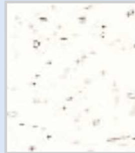
Aluminium Alloy with Solid Lubricant Material