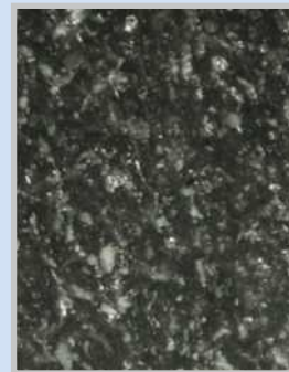
PEEK + Solid Lubricant + Fillers