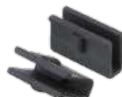
Shifting fork end clips