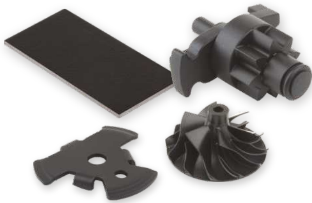
TriboShield ® coated products examples